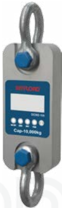
* shackles & indicators optional