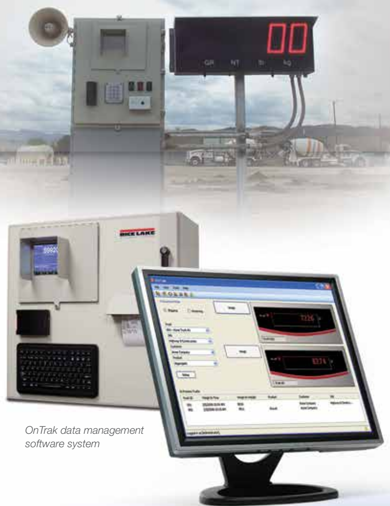
OnTrak data management software system

For large companies, we custom-design and build a kiosk integrating our hardware with the user's networks. Rice Lake engineers work together with the dealer and user, custom designing both hardware and software to fit needs.