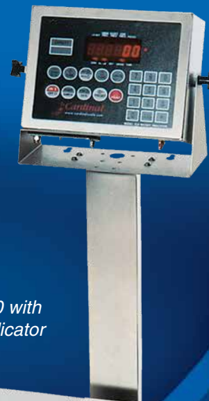
EB-300 with 210 Indicator