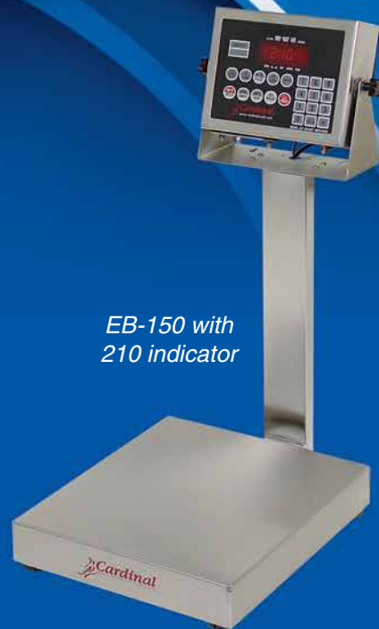
EB-150 with 210 indicator

Whatever your needs may be, select from Cardinal's complete line of stainless steel bench scales.