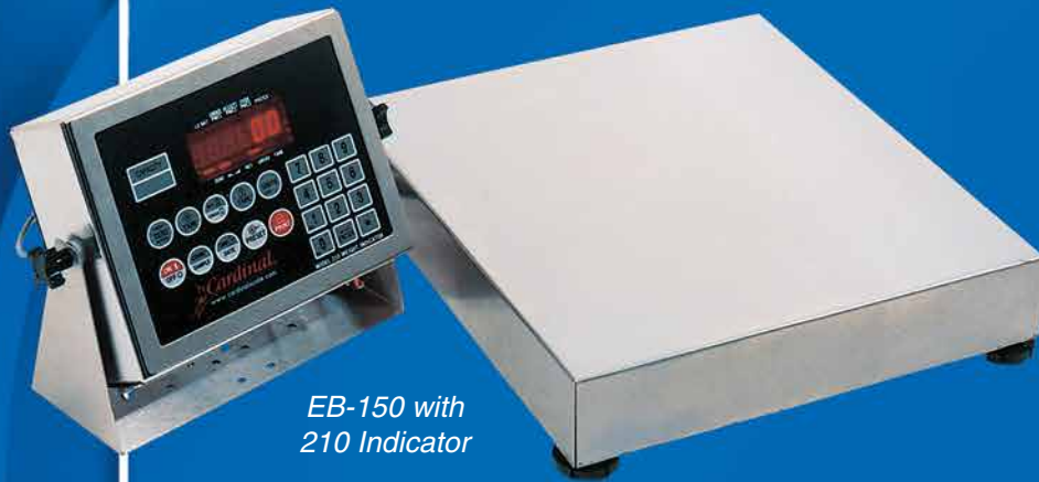
EB-150 with 210 Indicator

Designed for top performance and long-term accuracy.